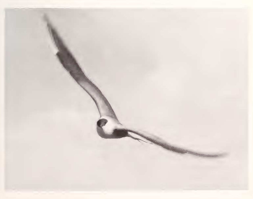
Fig. 16. Long-tailed jaeger above the Tuluksak River, 8 June 1974.